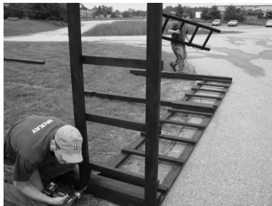
Step 5 Attach 72" end panels