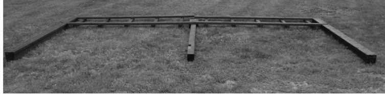
Step 1 & 2 Lay out the 106" right, middle & left poles and attach the 96" right & left front panels (stamped R & L)