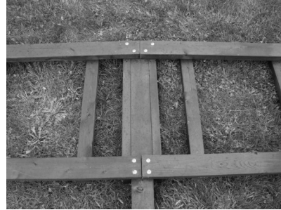
Step 2 & 3 Attaching the front panels to ends & middle of poles