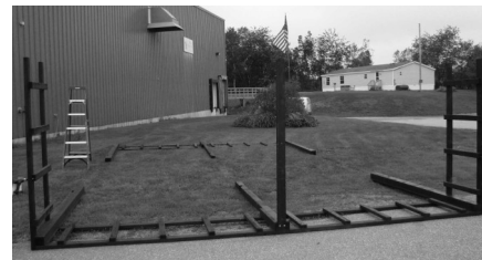
Step 6 Attach the 69" top brace to middle