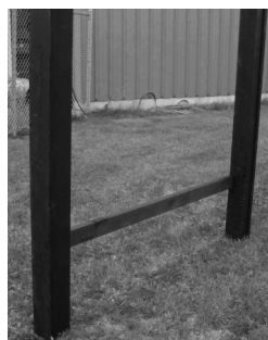
Step 8 Attach lower 69" brace