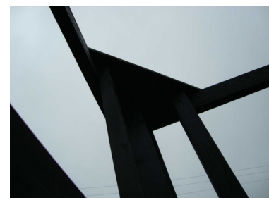
Step 9 Attach the gussets