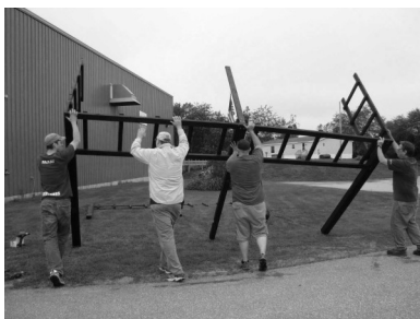
Step 7 Stand one side unit up